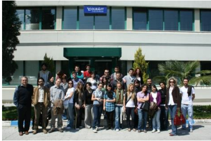
Duravit Factory, 2009 Spring