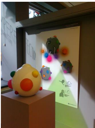
Ferit Sözen Yalçın