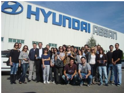
Hyundai Factory, 2010 Fall