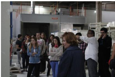
Bien Ceramics, Bozüyük Factory, 2012-2013 Fall