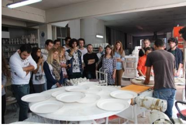
Yıldız Porcelain Factory, İstanbul, 2012-2013 Fall