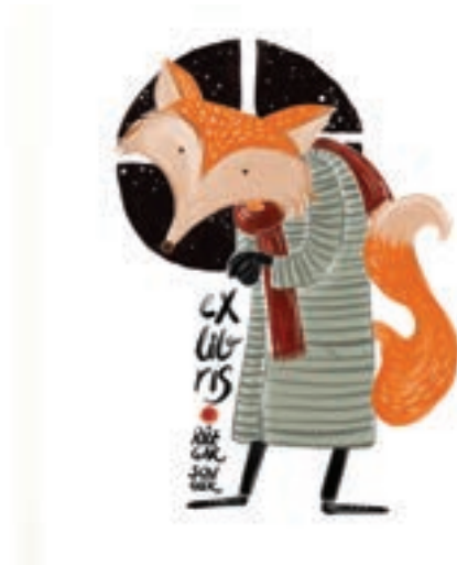
Elif Songür Dağ, "Ex-libris Rüzgar Songür", 2020