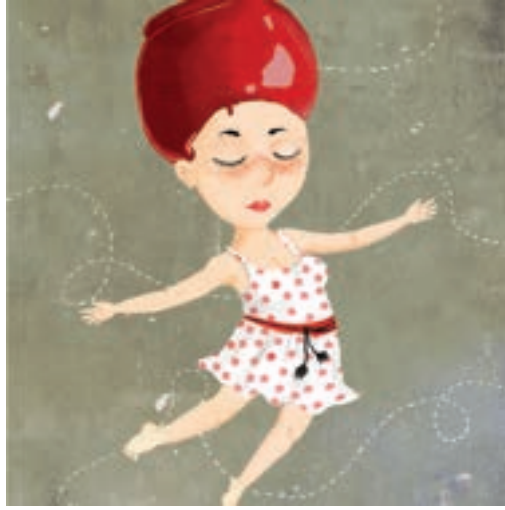
Elif Songür Dağ, "Apple Candy", 2010